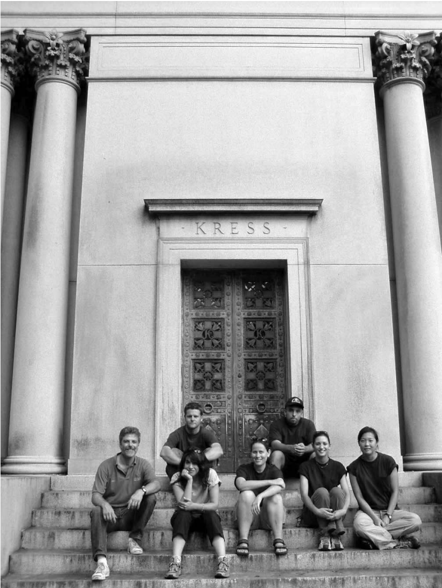
Kress Interns with the New York City Parks Department's Citywide Monuments Conservation Program, seated on the steps of the Kress Mausoleum in the Woodlawn Cemetery.