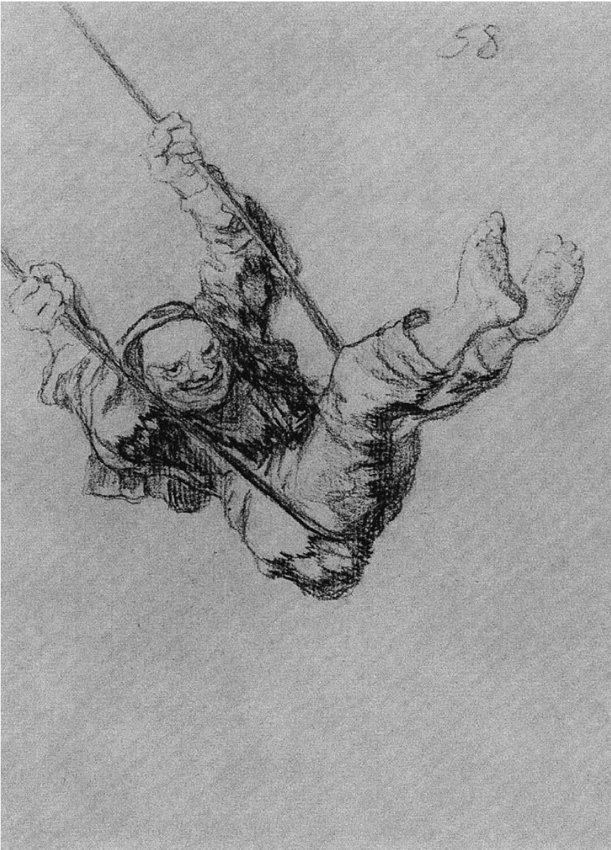
Old Man on a Swing, 1824–28, by Francisco Goya, Hispanic Society of America. Research for an exhibition on Goya's late works, in preparation at the Frick Collection, is supported by a grant for Works of Art in Museums.