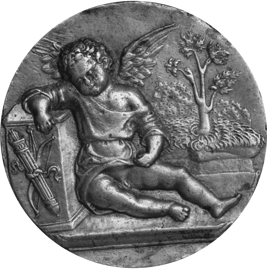
A 15th-century bronze medal, attributed to Donatello, representing an Allegory of the Power of Nature, in the collections of the University of California, Santa Barbara. A grant from the Old Masters in Context program supported the construction of a European Wunderkammer, or curiosities cabinet, for the display and study of Renaissance art in a traditional scholar's environment.