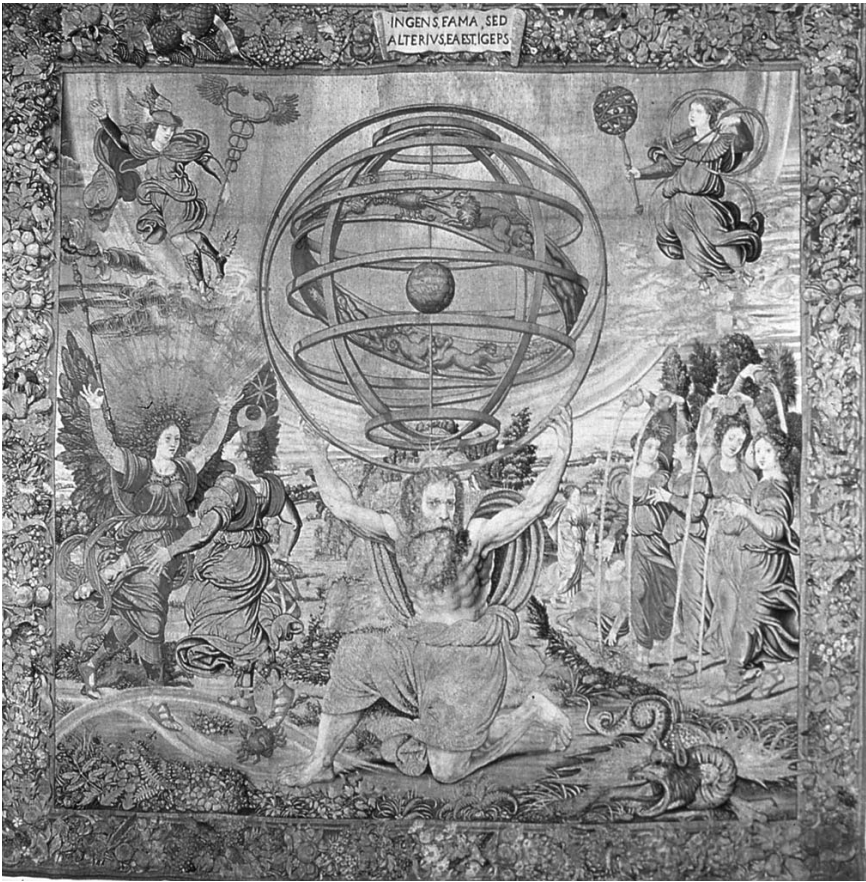
A tapestry of Atlas Supporting the Armillary Sphere, ca. 1530, by George Wezeler, from the Spanish Royal Collections was shown in the exhibition Spain and the Age of Exploration, 1492–1792, at the Seattle Museum of Art, which received a grant from the Old Masters in Context program.