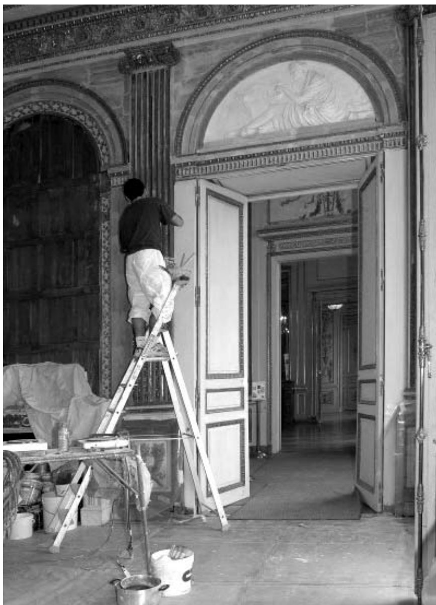
A restorer at work on the gilded interiors of the State Apartments of the Hôtel de Talleyrand (1767–69) Paris, France. The original configuration of the rooms was recreated with support from the European Preservation Program.