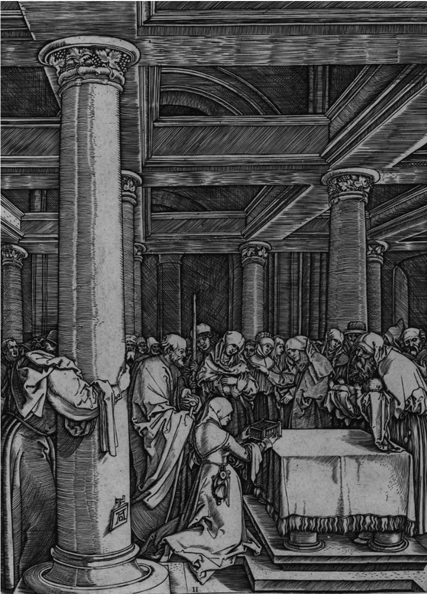
A woodcut of Presentation of Christ in the Temple, ca. 1506, by Marcantonio Raimondi after Albrecht Dürer, at the David and Alfred Smart Museum of Art, University of Chicago. An exhibition illustrating the importance of prints in disseminating artists' creations from 1500 to 1800 was awarded a grant from the Old Masters in Context program.