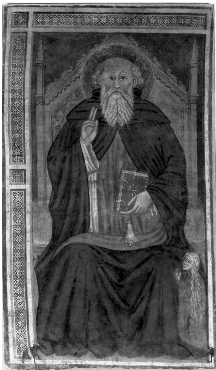
St. Anthony Abbot, one of four 14th-century frescoes from a house in Gubbio, Italy. The paintings are today in the collection of St. Paul's-Within-the-Walls, the American Episcopal Church in Rome, and were conserved for the exhibition Spellbound by Rome: The Anglo-American Community in Rome, 1890–1914 .