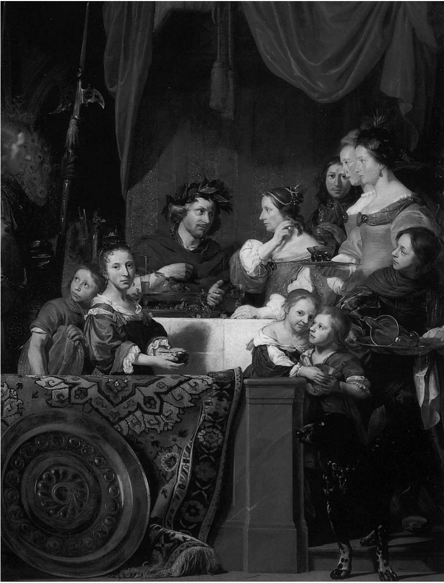
Banquet of Antony and Cleopatra, 1669, a portrait historié by Jan de Bray representing himself and his family in historical guise, at the Currier Museum of Art. An exhibition of de Bray's modes of portraiture was jointly mounted by the Currier, the National Gallery of Art, and the Speed Art Museum, with a grant from the Old Masters in Context program.